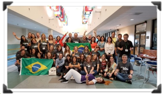
Brazilian lawyers and judges who participated in Victim Offender Conferencing training

Just Outcomes was invited to deliver its comprehensive training on Victim Offender Conferencing to groups of Brazilian judges, prosecutors and other professionals at the Summer Peacebuilding Institute in Virginia. We cannot say enough about the dedication, warmth and skill of our Brazilian friends!